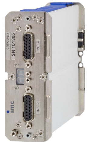
CRFX/BR2-4 (Fig. similar)