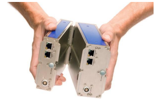
imc Click Mechanism

Alternatively, connection can be made by means of standard Ethernet cables (RJ45, CAT5), thus creating a spatially distributed system.