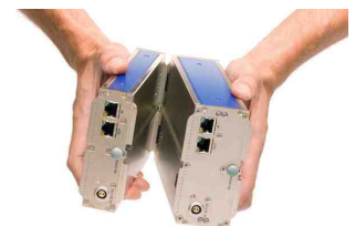
imc Click Mechanism

Alternatively, connection can be made by means of standard Ethernet cables (RJ45, CAT5), thus creating a spatially distributed system.