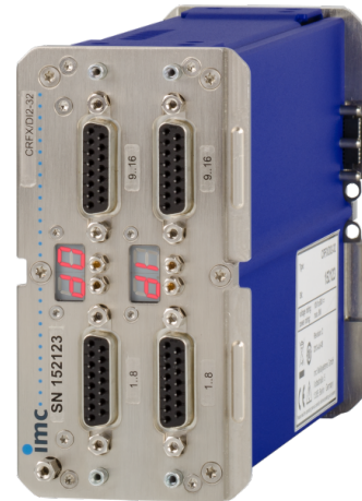
imc CRONOSflex Module (CRFX/DI2-32)

32-channel modules can be chosen as pure DO or DI type modules or as a combined one (16+16). Those modules are implemented as "Double-modules" acting as two logical modules with their respective IDs displayed on two 7-segment displays.